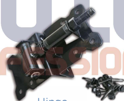
Hinge Sold in Pairs