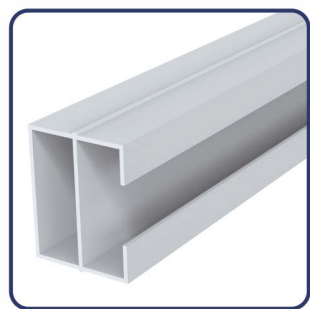
H- Post U groove